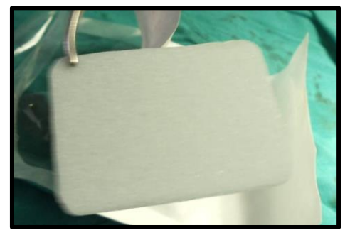
Fig. 1: Implant present in double peel pouch