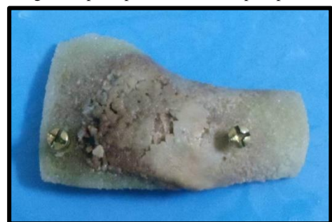
Fig. 3: Implant can be fixed with screws