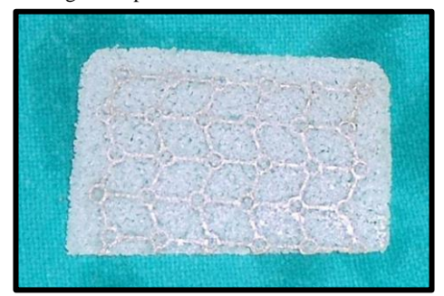
Fig. 5: Titanium embedded h.d.p.e implant

with the time dimension. At other times however, events served as impetus to the progress of allograft transplantation. Indeed, necessity is the mother of invention. Conceptually, autogenous bone would be the material of choice to restore the defects of the craniofacial skeleton because it has a potential to revascularize and further get incorporated into the facial skeleton, so much so that with time it would be biologically indistinguishable from the adjacent native skeleton. Practically, the use of autogenous bone is limited and the morbidity, increased intraoperative time and hospitalization costs associated with autogenous bone graft harvest can be significant. Furthermore, the inevitable resorption and the poor handling characteristics of autogenous bone grafts also limit the quality and predictability of the result. The need of remodeling the harvested bone into complex shapes may also complicate the surgery. In addition, significant bone resorption using free bone grafts along with morbidity and risks from harvesting bone grafts cannot be disregarded. Demineralized bone matrix